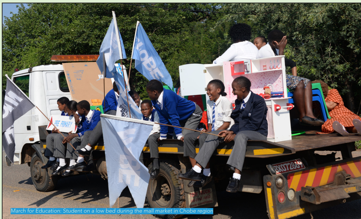
March for Education: Student on a low bed during the mall market in Chobe region

Article by | K. Molete Chobe Region: CLO